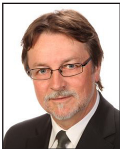
Chair of the Board Hockey Canada 2020-21