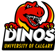
University of Calgary